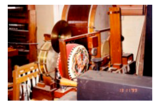
mto Christie Toy Counter