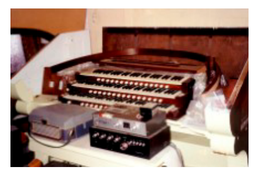
mto Christie three manual keyboard