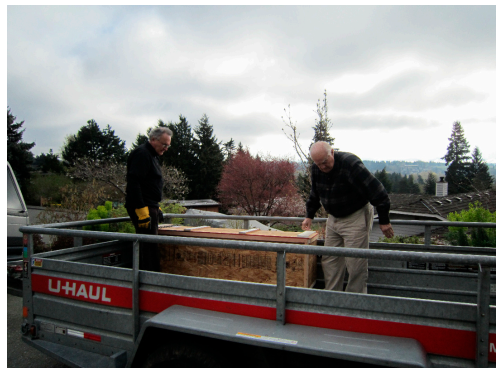
One down two to go