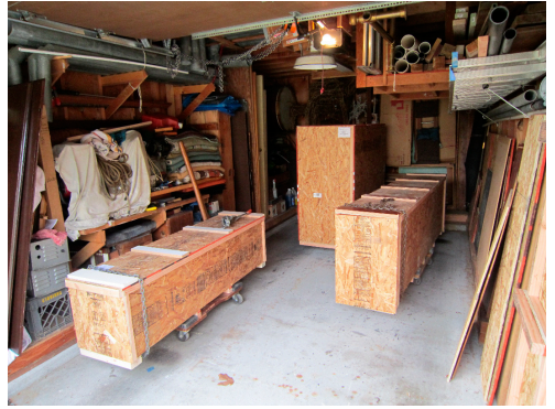
Components packed for shipping