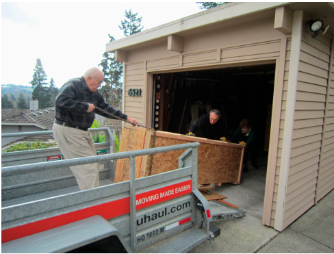
Heave-Ho with all hands