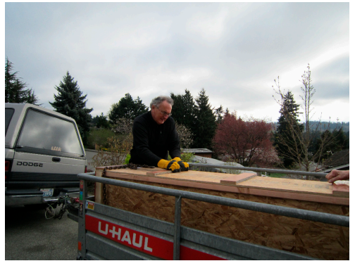
Feels good, box two in place