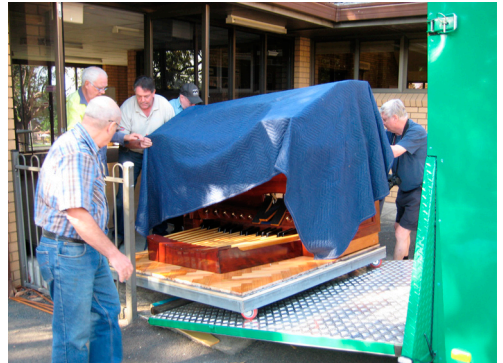
Console on platform Down the trailer tailgate onto entrance