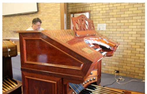
Now that looks like a Christie cosole