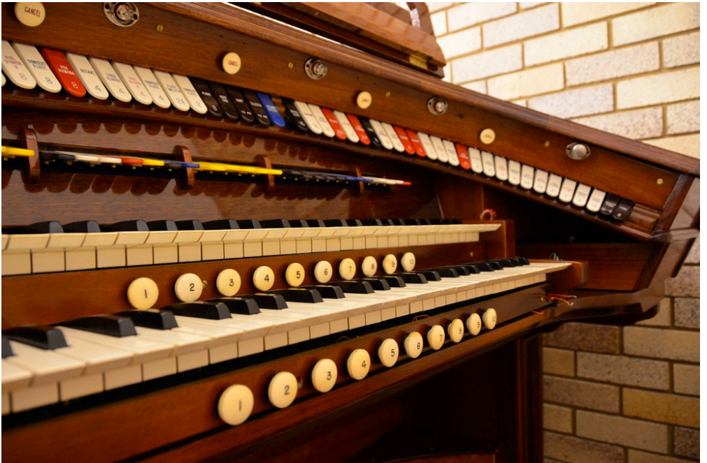
There is still quite an amount of work to be done in connecting up various items. Looking great so far.