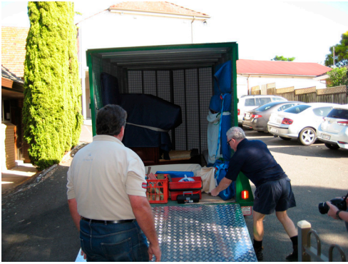
Preparing to unload