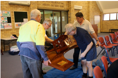
Time to fit the top