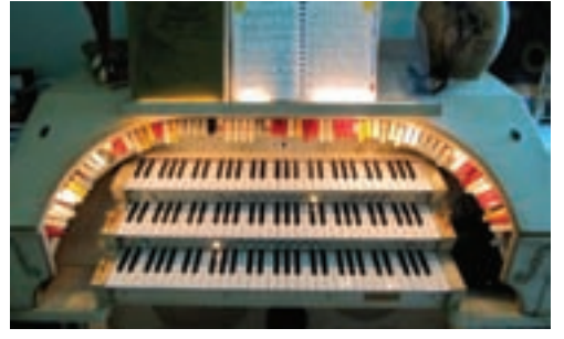
The Rogers Trio "C"