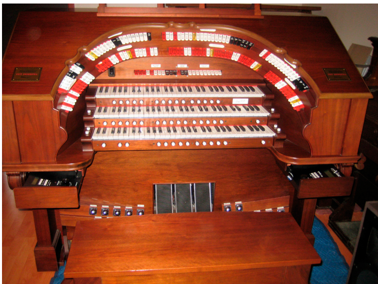
George Wright 319EX showing drawers under either side of the Console - left drawer is organ controls; right drawer is Allen Vista Midi controls