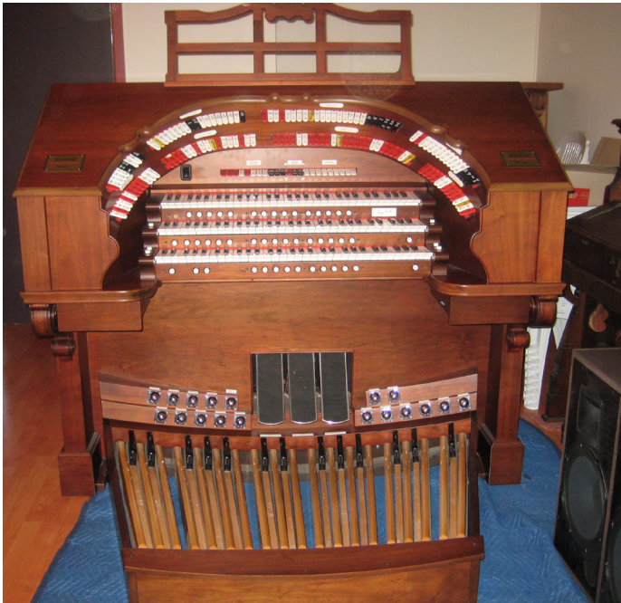
The George Wright Signature Series 319EX Allen Organ