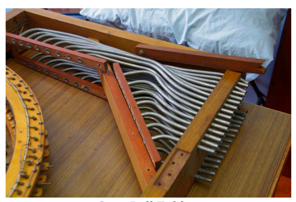
Stop Rail Tubing