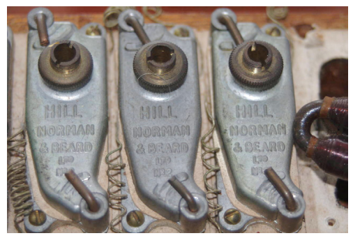
Hill Norman & Beard Ltd Magnets