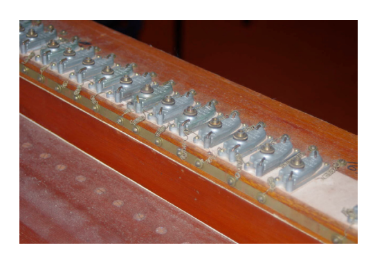
Chest restored with new gaskets and magnets cleaned