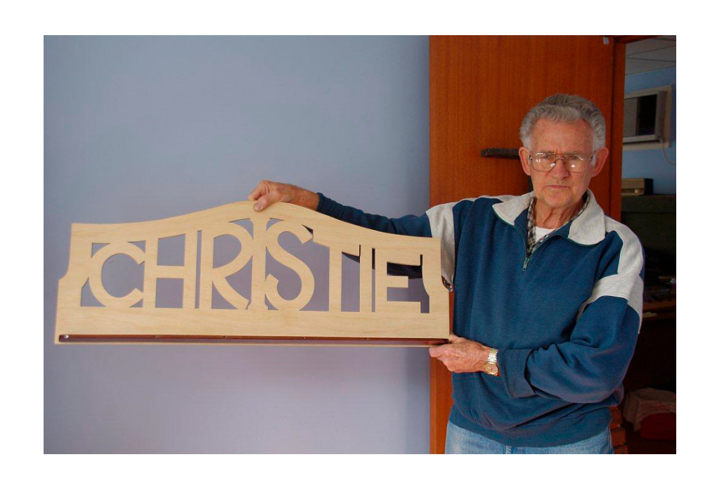
New Christie Music Rack