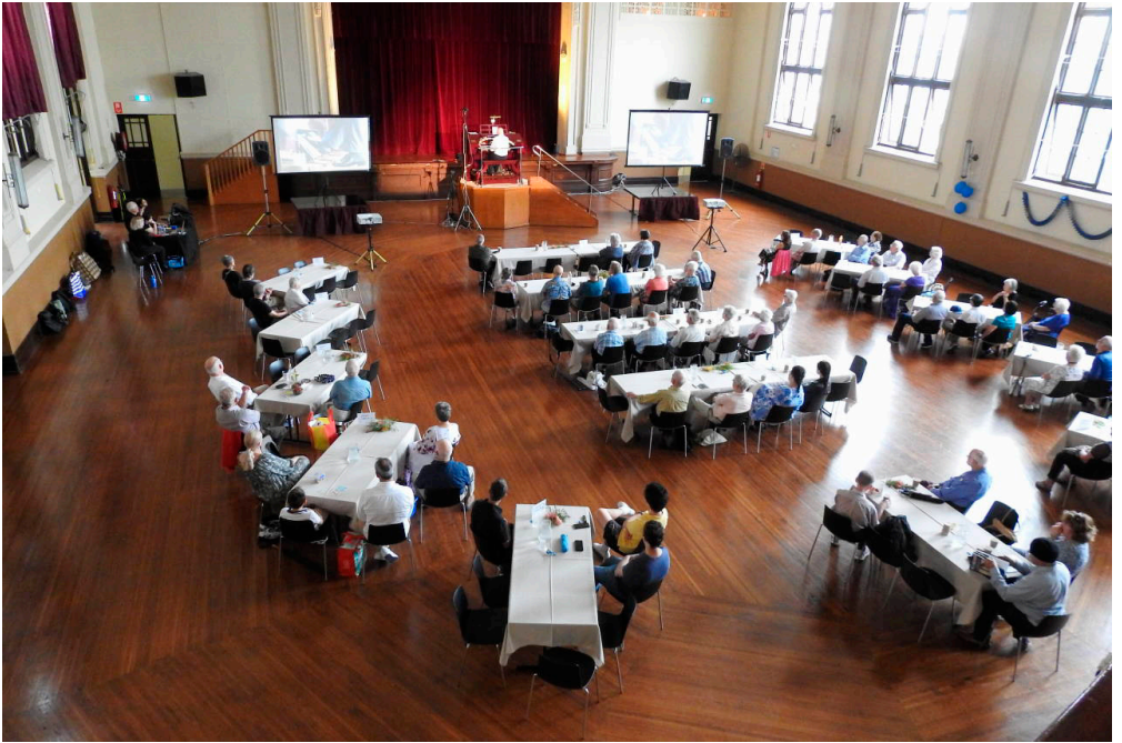
where Cliff Bingham and Simon Ellis entertained on your Wurlitzer Unit Orchestra