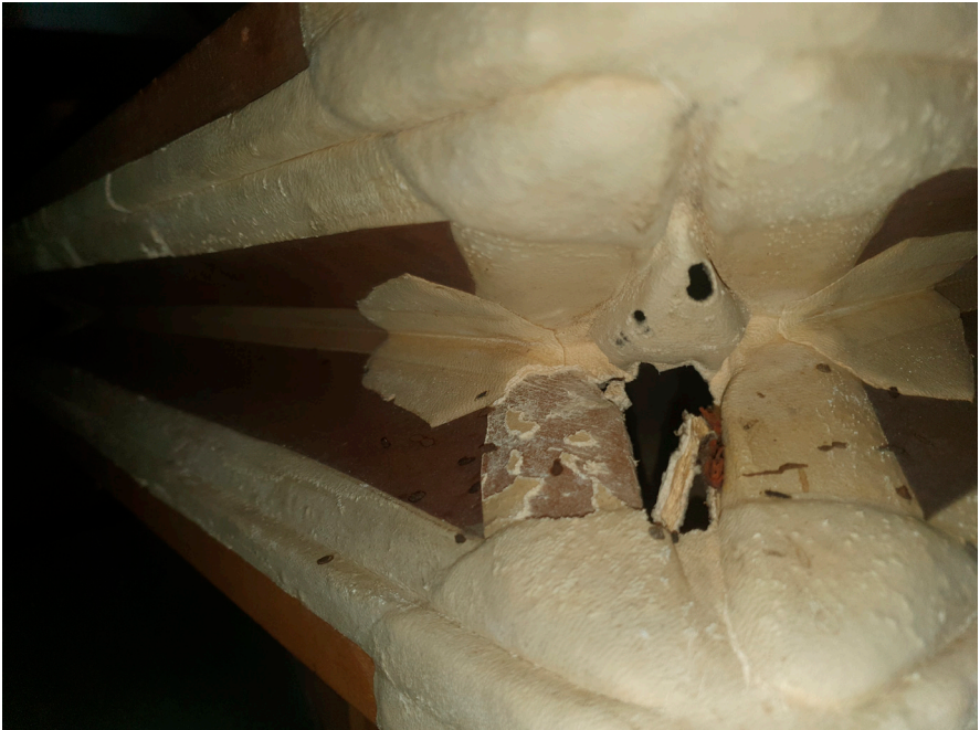
Blown out corner of the Trumpet Regulator, Orion Wurlitzer