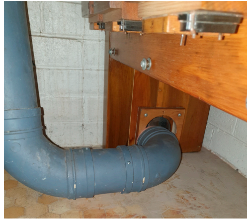
The trunking to the 16' Tibia offset chest back in place following reinstallation of the refurbished chest