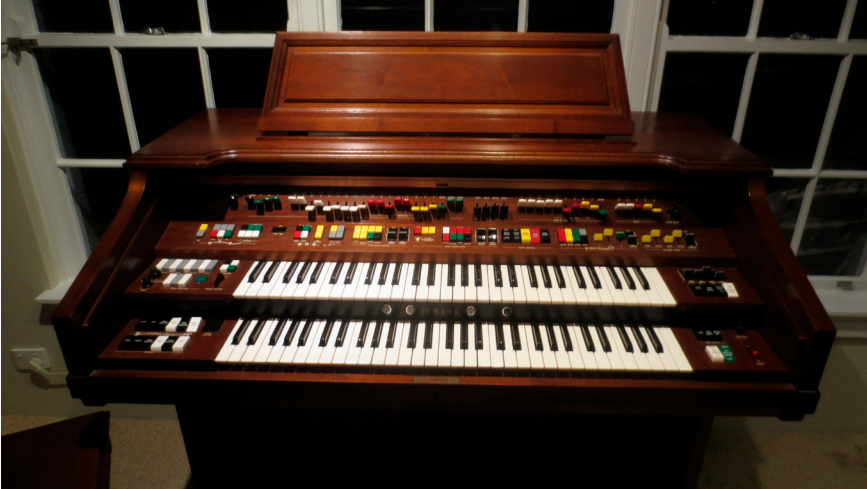
Yamaha E45 Electone Organ - located in St. Ives

The Yamaha E45 as illustrated is in excellent condition, it is located in St Ives and is available for purchase based on pick up from our home. No reasonable offer will be refused for this versatile instrument that reluctantly must move to a new home. Please Call John or Leah on 9449 6553.