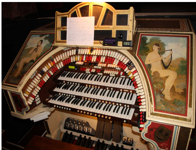
The Riviera Theatre Console

The Wurlitzer Tower still holds a commanding position over the site, but the factories are now put to other uses. It was kind of eerie to be at the place where it all happened so many years ago, and was part of the basis of why we were getting together for the Convention. From there it was a short drive to our first venue for the day, the Riviera Theatre, North Tonawanda , housing a 3/16 Wurlitzer , originally around 11 ranks. This was the closest Wurlitzer installation to the factory, and in the days of production, this organ was used as a demonstrator instrument for moderately sized Wurlitzers. The console treatment is one of a kind, featuring painted cupid murals by an artist from the Wurlitzer Band Organ division.