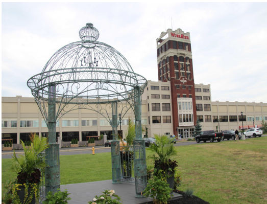
The Wurlitzer factory in North Tonawanda

Tuesday (July 2nd) was Buffalo Day . Buffalo is a city on the shores of Lake Erie about an hour's drive from Rochester. Once a vibrant industrial city, it has seen a downturn in fortunes with changes in employment, as has Rochester, once a vigorous hub with industries like Kodak, Polaroid and Bausch and Lomb, but sadly now in decline. Our first stop for a photo opportunity was at the site of the Wurlitzer factory in North Tonawanda , where Wurlitzer theatre organs were manufactured from about 1914 to 1940.