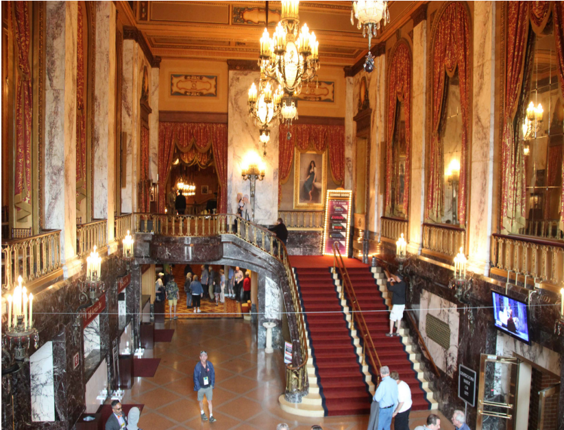
Foyer at Shea's Buffalo

awesome spectrum of sounds that will long be remembered. What a day! (I could almost have died and gone to heaven!) This day was in itself worth all the costs of getting to the convention.