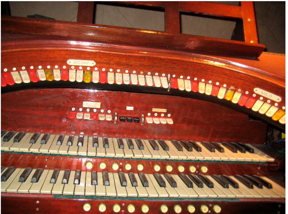
The console is tucked away behind the stairs now