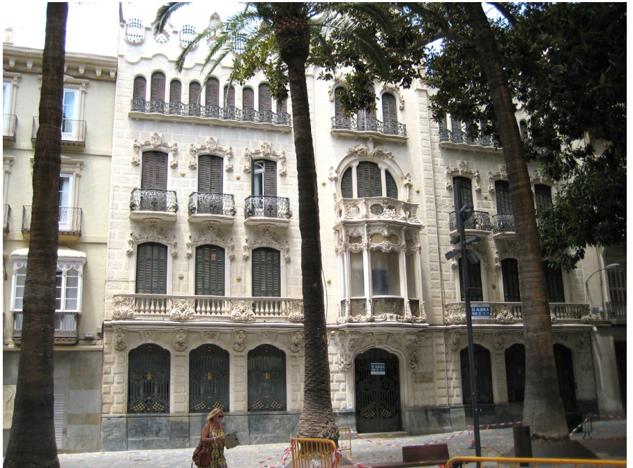
Some typical Spanish architecture in the town square