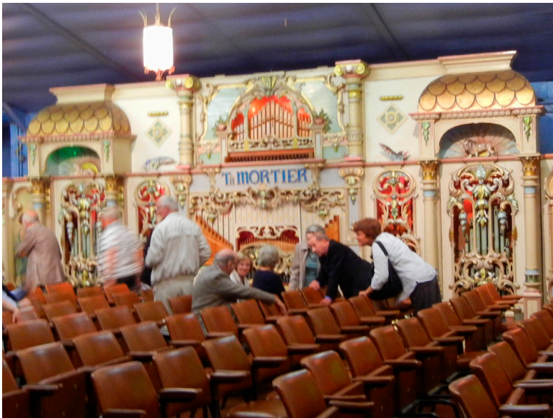
Another Belgian Dance Organ