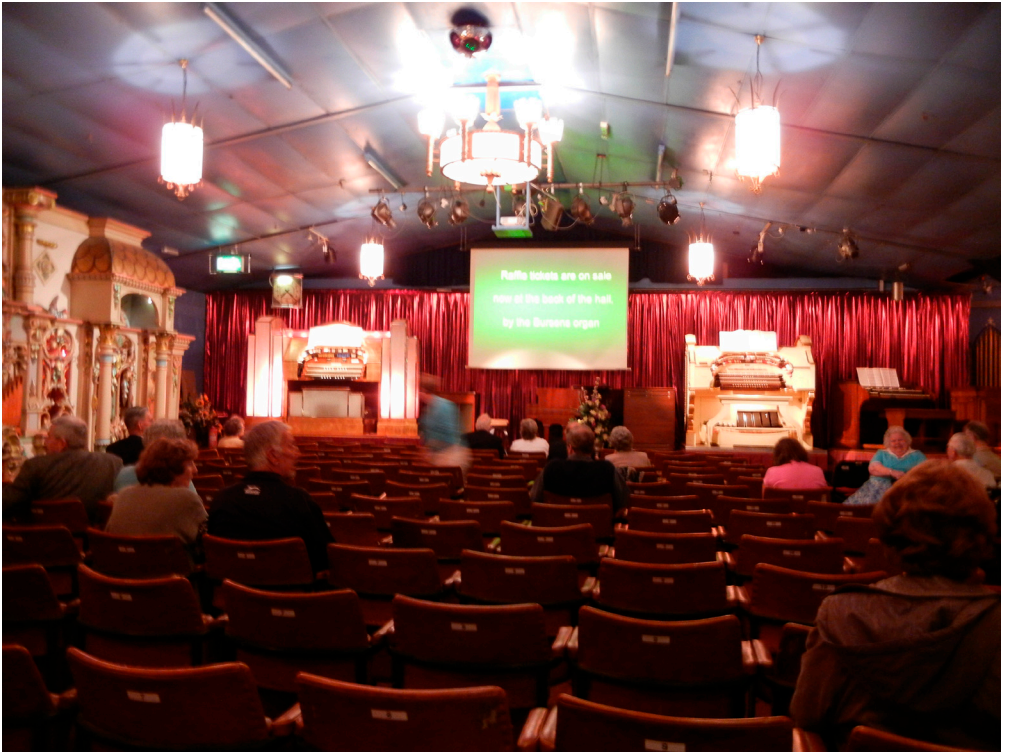
The Spurden-Rutt is on the left and the Wurlitzer is on the right