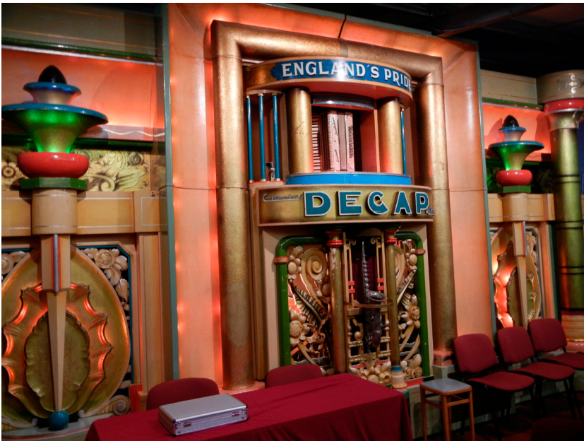
121 key Decap "Nethe", renamed "England's Pride".