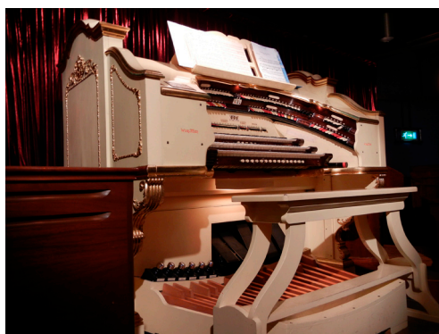
Wurlitzer Console formerly used in a London Cinema

The writer can well recommend a visit to this most unique attraction. The day to day running of the St. Albans Organ Museum relies solely on that ever depleting resource, volunteer support. And what a magnificent effort all of those volunteers undertake to both house and maintain the collection, at the same time making it accessible to the general public.