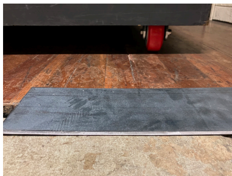
Above: One of the replacement castor wheels and removeable plate

I believe at the second player's event there were a few more ciphers but reports are that these were able to be cleared by repeating the notes. Those present enjoyed being able to play the Orion Wurlitzer again after such a long hiatus.