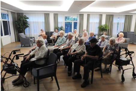
Above: The audience at George's Estate