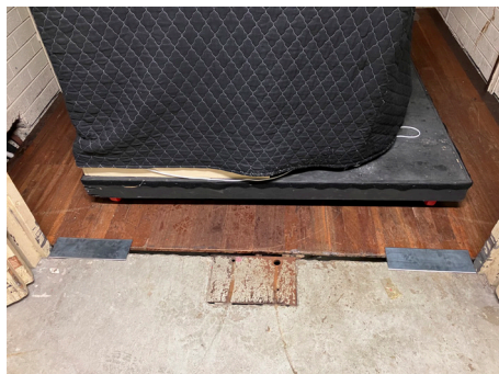
Below: The new removable plates