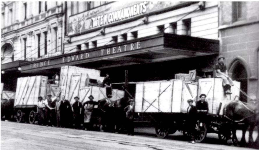
The Wurlitzer Organ being delivered and un-crated at the Prince Edward Theatre