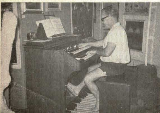
Broken Hill artist PRO HART (it's hot in Summer) has installed a C3 Hammond in his gallery.