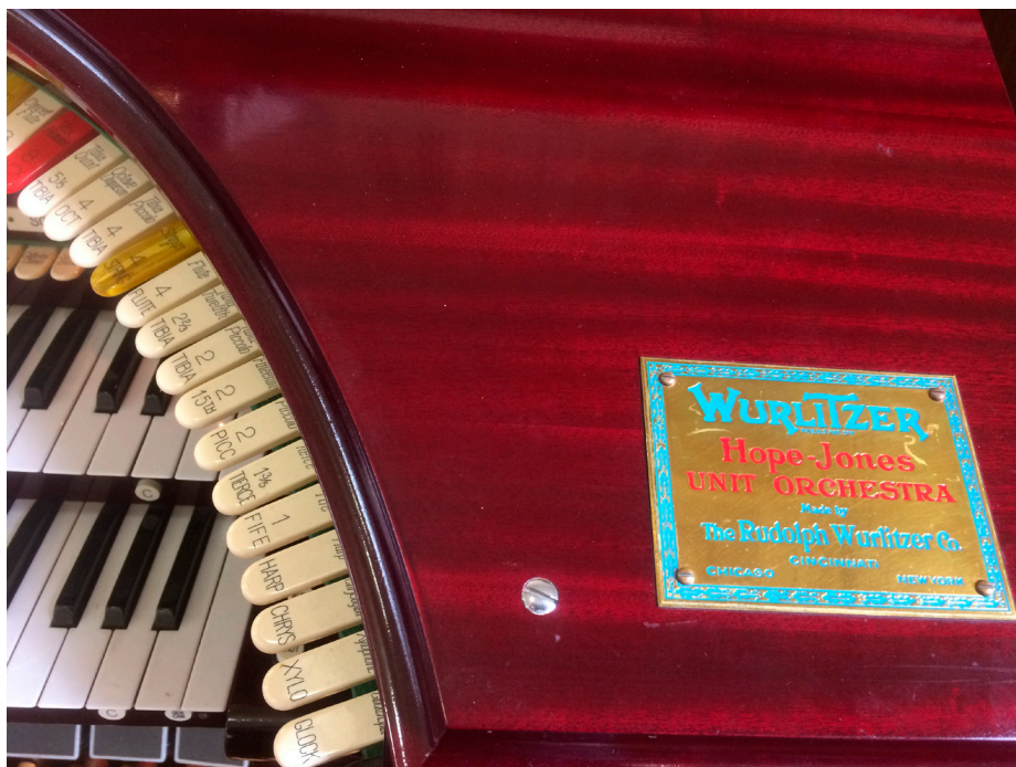
The Marrickville Wurlitzer Unit Orchestra plate on the console

While the ex Capitol Wurlitzer remained in storage, its Marimba-Harp and Krumet rank were temporarily used at Marrickville (Krumet in place of the Kinura). Organists who played Marrickville during this time noted how much more versatile the Krumet rank was compared to the Kinura.