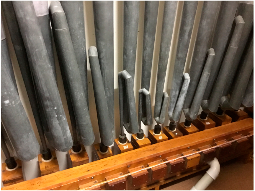
Wurlitzer Metal Diaphones