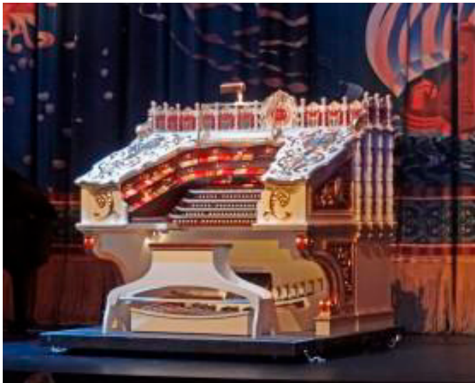
Refurbished 4-manual 23-rank Robert Morton in the Balboa Theatre