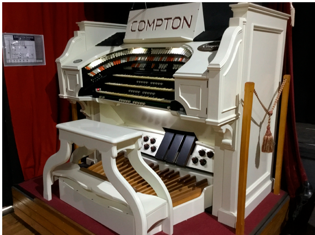
The Pomona Compton Console