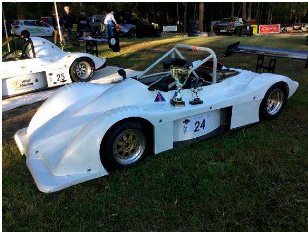
The winning Minetti SSV - 1 built by Scott