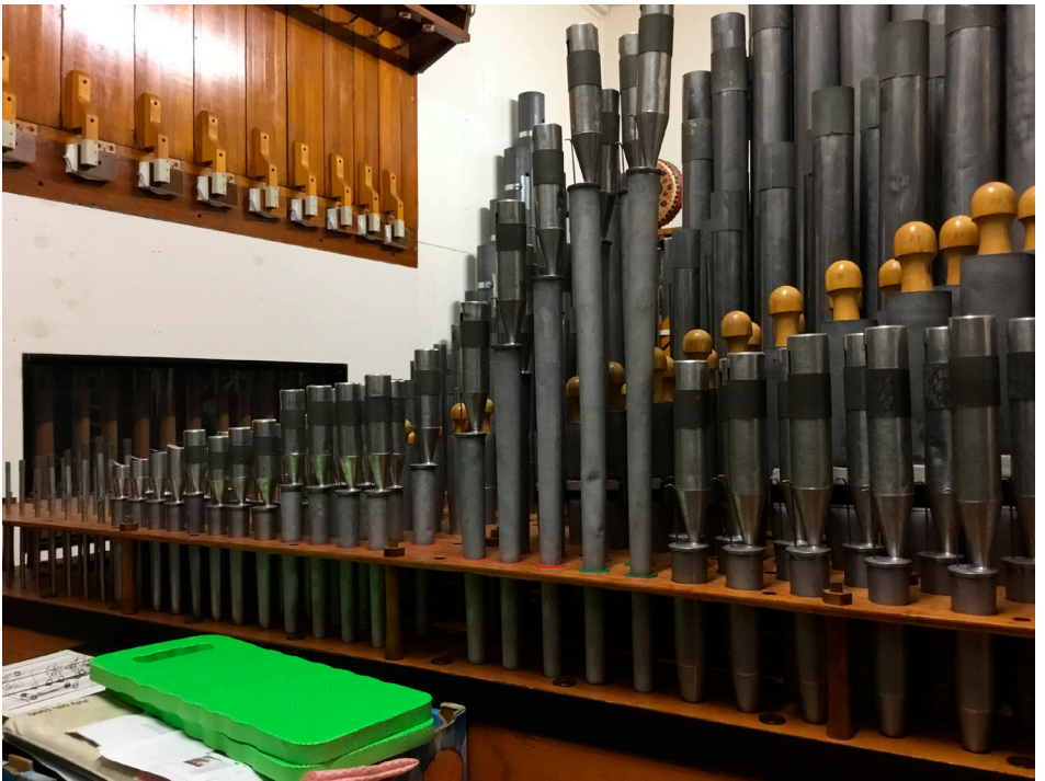
Compton vox humana & metal Tibia