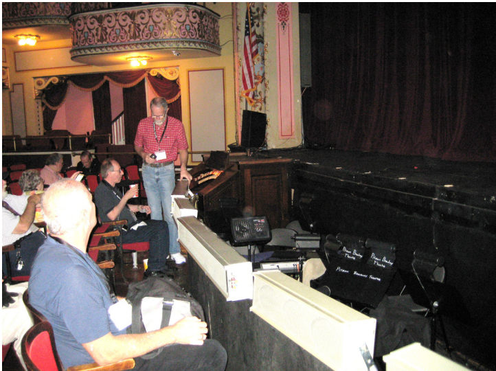
Broadway Theatre, Pitman, 3/8 Kimball & Orchestra Pit