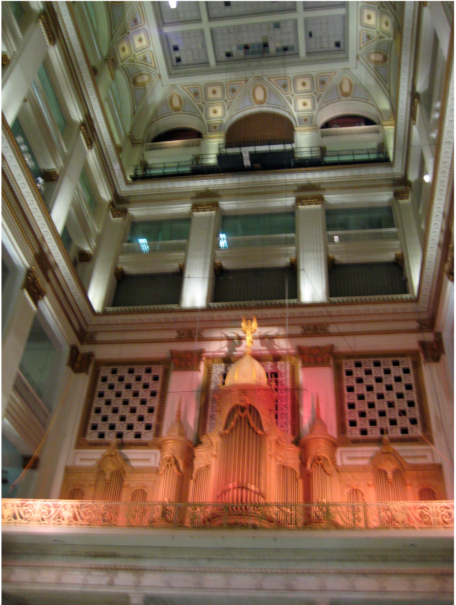
The Wanamaker Grand Court Organ, Macy's Philadelphia Six ivory keyboards, 729 color-coded stop tablets, 168 piston buttons under the keyboards and 42 foot controls. 28,482 pipes. It is all enveloping but not overpowering.