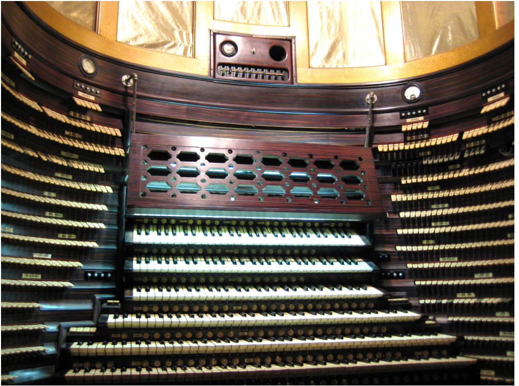
The Midmer-Losh console comprising 7 keyboards (the top keyboard is underneath the music rack). The bottom two have 85 notes, the next has 73 notes and the other 4 have 61 notes each.