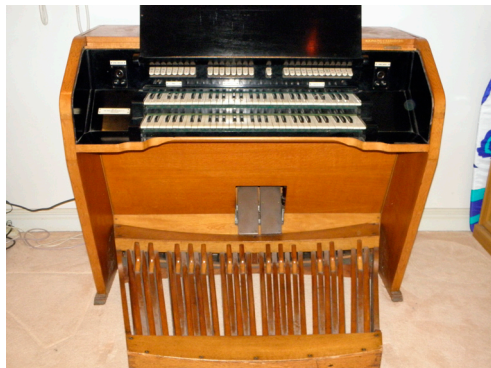
Compton 357 CS

Compton 357 CS organ. Recently has stopped working and one of the rectifier valves in the power supply unit will need replacing. There is also some microphony that comes through the tone cabinet.