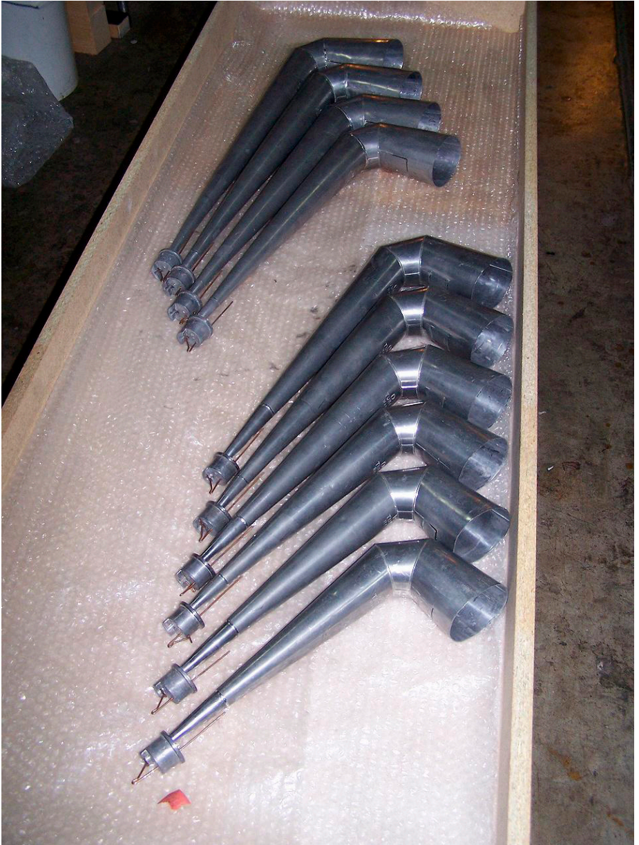
Pipes boxed for transport