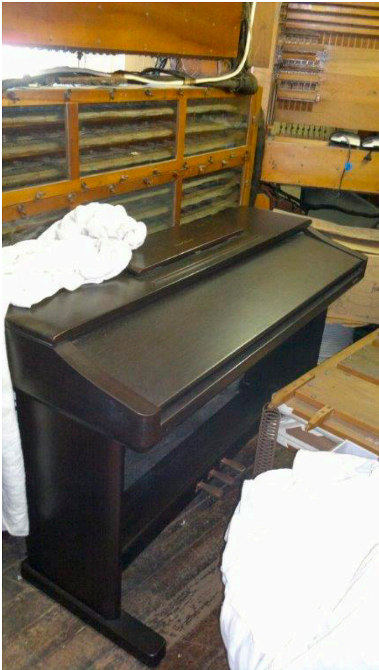
Digital piano in storage at Marrickville