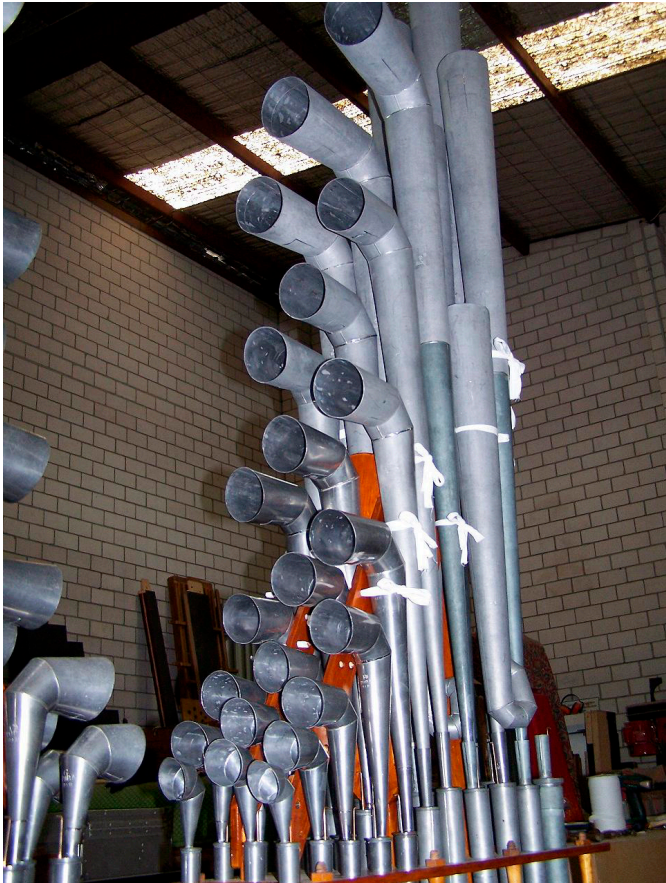
Tuba pipes racked