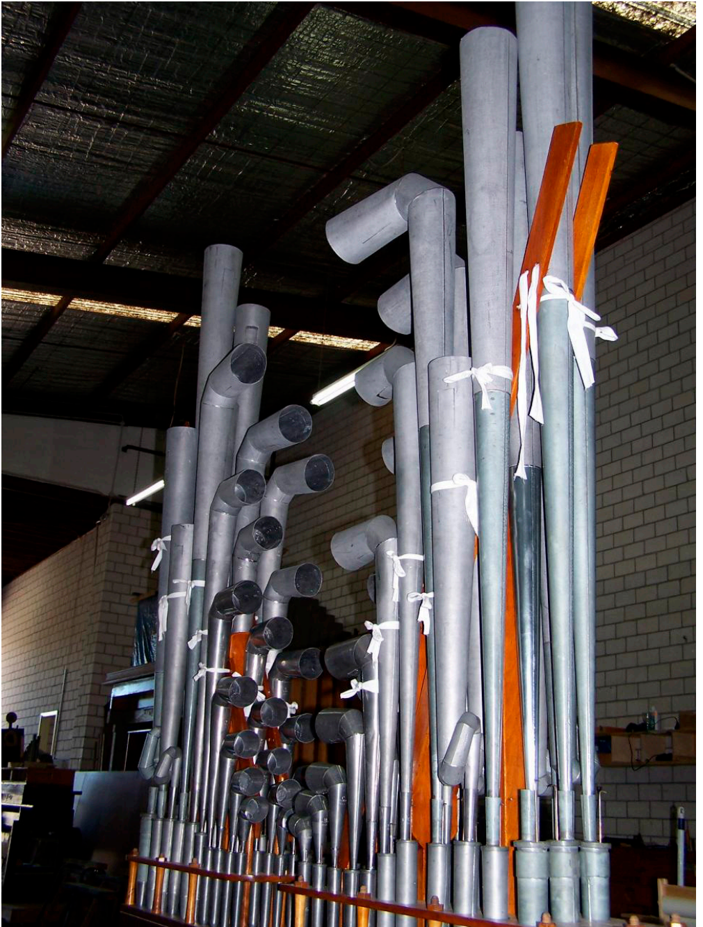
The completed Tuba Rank racked