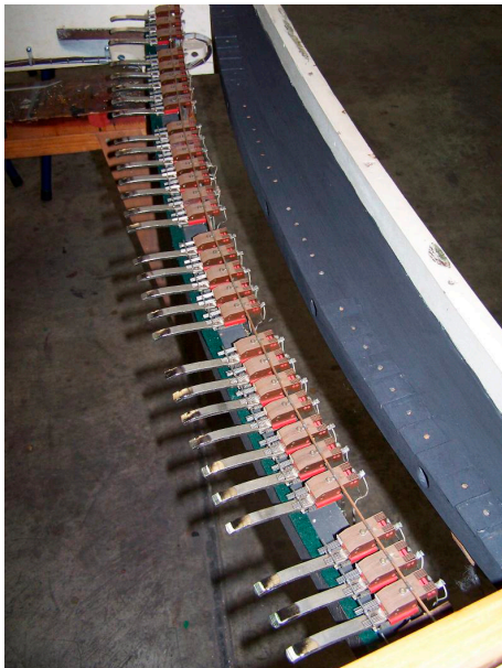
Some photos of the updating of the Orion Wurlitzer Pedal Board