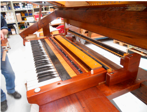
The lower manual is in place