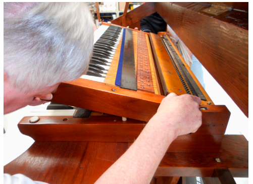
The upper manual slots into place