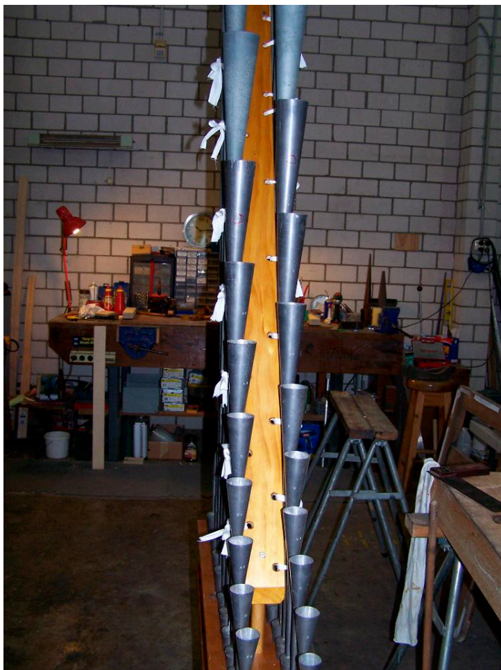
Marrickville English Post Horn rank, cleaned and racked with new pipe stay installed