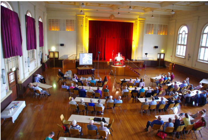
Audience at the Christie Organ Fund Raiser show at Marrickville Town Hall April 2012

TOSA Committee and Technical Team member