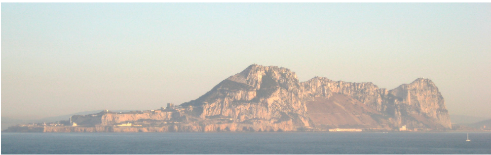
This lump of Limestone appeared out of the mist early morning