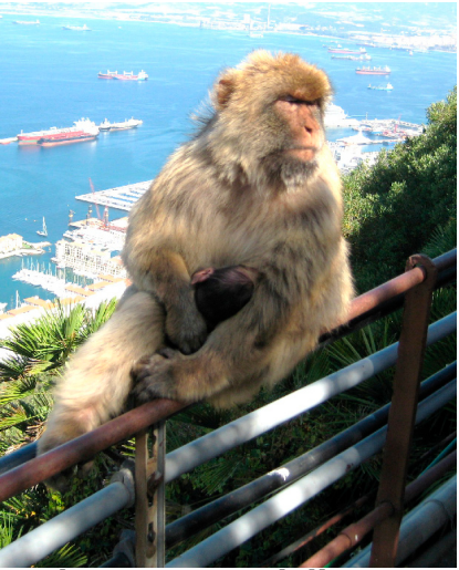
Barbery Ape cradeling young