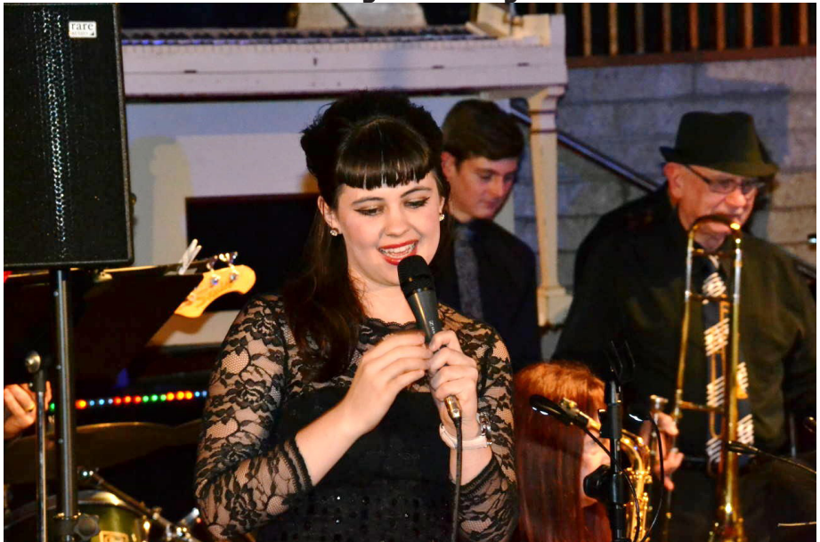
A former student of Kelvin Grove State College proved to be an excellent Jazz singer, confidently performing with the band