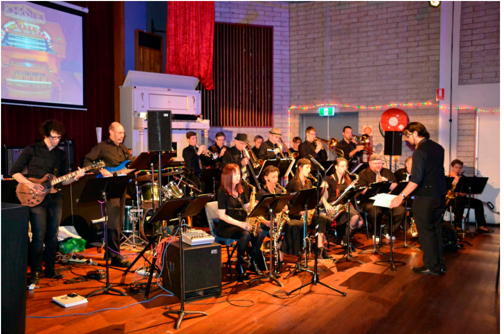
The Kate Street Mob Big Band entertained us on Saturday night with some great swing music