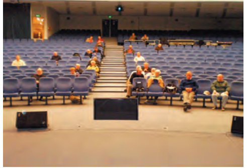
Members enjoy the Christie