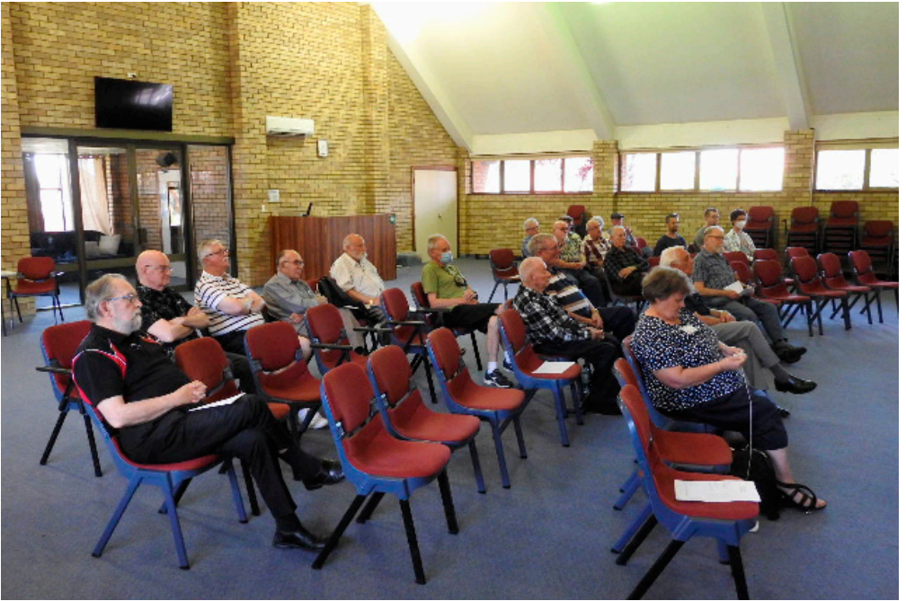
Members at the AGM