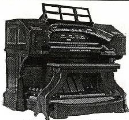
Marrickville Town Hall