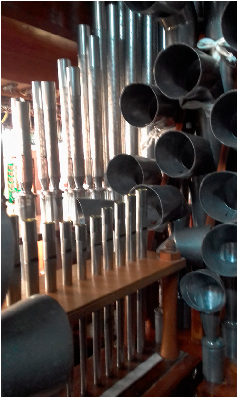
Tuba & top 12 notes of Clarion