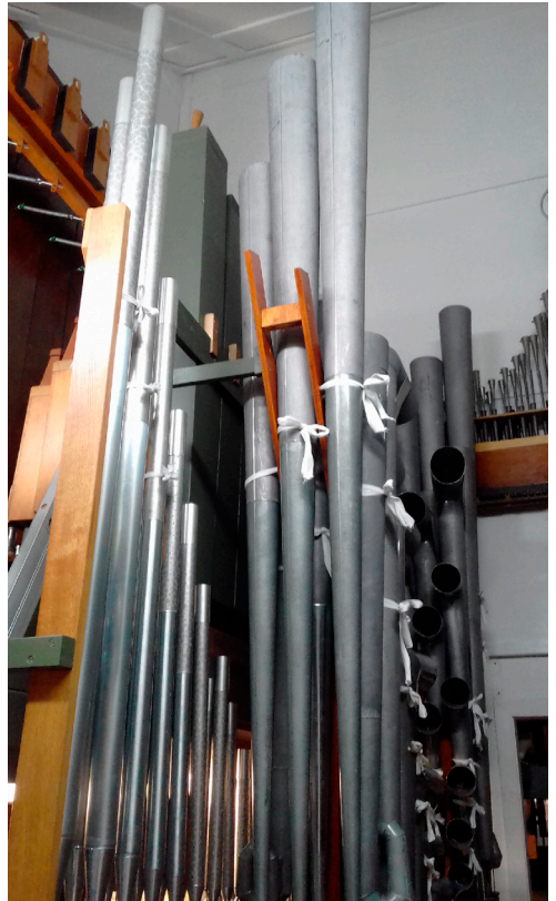
Tuba on the right