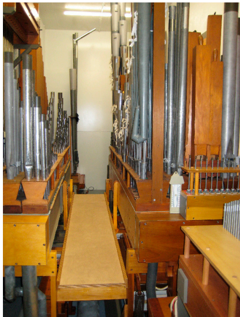
Large Wurlitzer chest on right